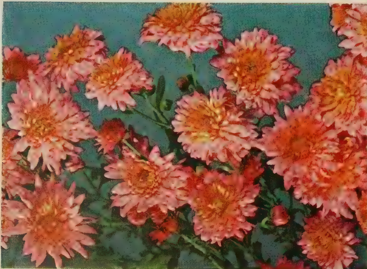
GLADNESS. 50c each; 3 for $1.25